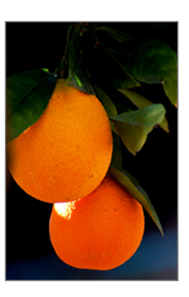
Robertson Navel Orange fruit