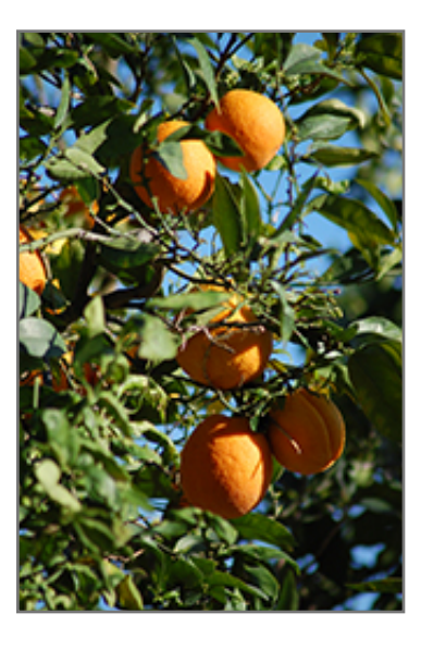
Moro Blood Orange fruit

Moro Blood Orange features showy clusters of fragrant white star-shaped flowers at the ends of the branches from late winter to early spring. It has dark green evergreen foliage. The glossy oval leaves remain dark green throughout the winter. It features an abundance of magnificent orange berries with red blush from late fall to late winter.