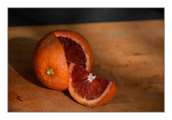
Moro Blood Orange fruit