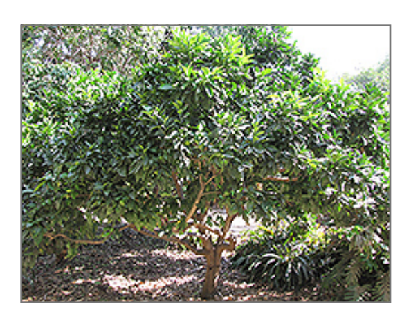
Moro Blood Orange

Moro Blood Orange is a good choice for the edible garden, but it is also well-suited for use in outdoor pots and containers. Its large size and upright habit of growth lend it for use as a solitary accent, or in a composition surrounded by smaller plants around the base and those that spill over the edges. It is even sizeable enough that it can be grown alone in a suitable container. Note that when grown in a container, it may not perform exactly as indicated on the tag - this is to be expected. Also note that when growing plants in outdoor containers and baskets, they may require more frequent waterings than they would in the yard or garden.