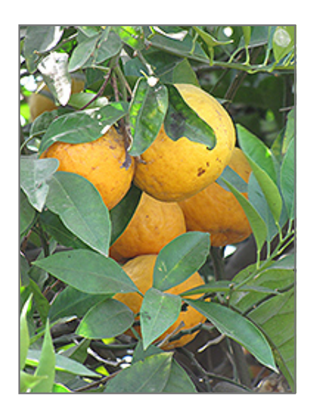
Tangor fruit

Tangor features showy clusters of fragrant white star-shaped flowers with buttery yellow eyes at the ends of the branches from early to mid spring. It has attractive dark green foliage with grayish green undersides. The glossy pointy leaves are highly ornamental and remain dark green throughout the winter. It features an abundance of magnificent orange berries with yellow hints from late fall to early spring.