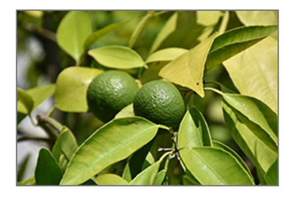
Tangor fruit