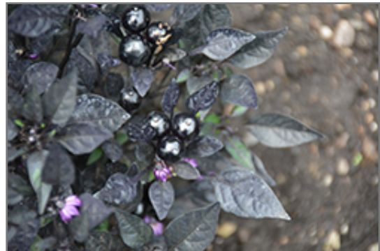
Onyx Red Ornamental Pepper fruit