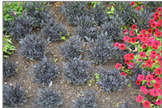
Onyx Red Ornamental Pepper

This plant will require occasional maintenance and upkeep, and should not require much pruning, except when necessary, such as to remove dieback. It is a good choice for attracting bees and butterflies to your yard, but is not particularly attractive to deer who tend to leave it alone in favor of tastier treats. It has no significant negative characteristics.