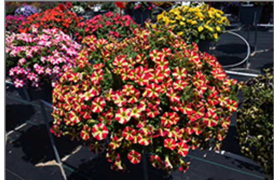
Amore Queen of Hearts Petunia in bloom

Amore Queen of Hearts Petunia is a fine choice for the garden, but it is also a good selection for planting in outdoor containers and hanging baskets. It is often used as a 'filler' in the 'spiller-thriller-filler' container combination, providing a mass of flowers against which the thriller plants stand out. Note that when growing plants in outdoor containers and baskets, they may require more frequent waterings than they would in the yard or garden.