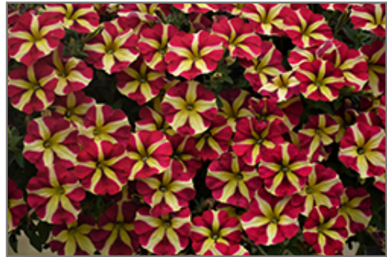
Amore Queen of Hearts Petunia flowers