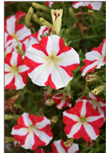
Amore King of Hearts Petunia flowers

Amore King of Hearts Petunia is recommended for the following landscape applications;