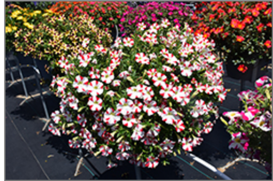
Amore King of Hearts Petunia in bloom

Amore King of Hearts Petunia will grow to be about 12 inches tall at maturity, with a spread of 14 inches. When grown in masses or used as a bedding plant, individual plants should be spaced approximately 10 inches apart. Its foliage tends to remain dense right to the ground, not requiring facer plants in front. This fast-growing annual will normally live for one full growing season, needing replacement the following year.