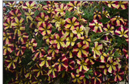
Amore Fiesta Petunia flowers