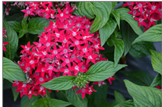
Lucky Star Raspberry Star Flower flowers