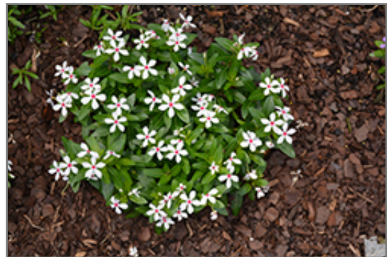
Soiree Kawaii White Peppermint Vinca in bloom