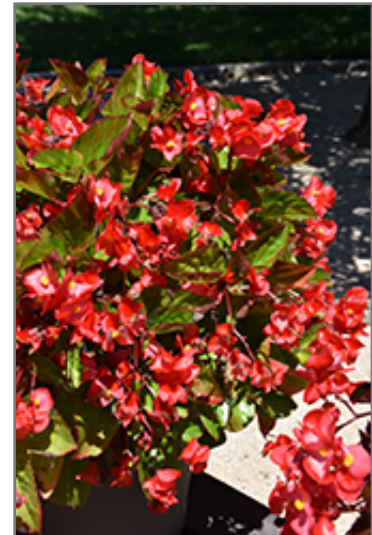
Viking XL Red on Green Begonia flowers