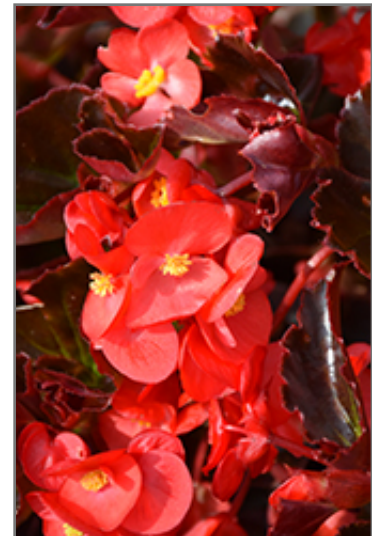
Viking Red on Chocolate Begonia flowers

Viking Red on Chocolate Begonia is recommended for the following landscape applications;