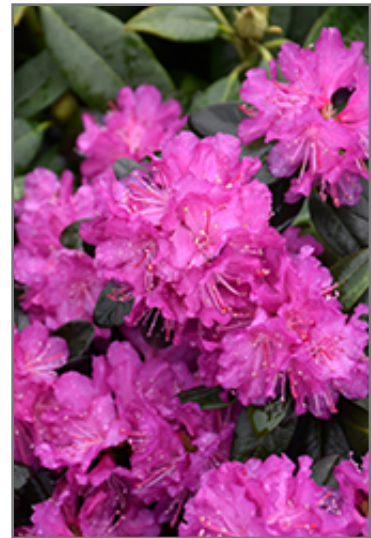
P.J.M. Elite Star Rhododendron flowers

P.J.M. Elite Star Rhododendron will grow to be about 4 feet tall at maturity, with a spread of 4 feet. It tends to be a little leggy, with a typical clearance of 1 foot from the ground. It grows at a slow rate, and under ideal conditions can be expected to live for 40 years or more.