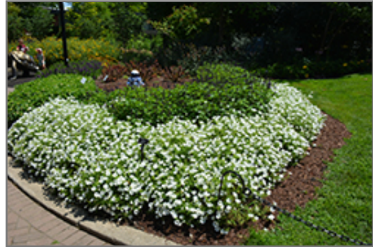
Supertunia Vista Snowdrift Petunia in bloom

Supertunia Vista Snowdrift Petunia is a fine choice for the garden, but it is also a good selection for planting in outdoor containers and hanging baskets. Because of its trailing habit of growth, it is ideally suited for use as a 'spiller' in the 'spiller-thriller-filler' container combination; plant it near the edges where it can spill gracefully over the pot. It is even sizeable enough that it can be grown alone in a suitable container. Note that when growing plants in outdoor containers and baskets, they may require more frequent waterings than they would in the yard or garden.