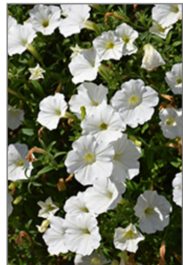
Supertunia Vista Snowdrift Petunia flowers