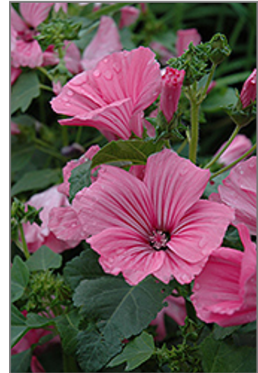
Novella Rose Lavatera flowers