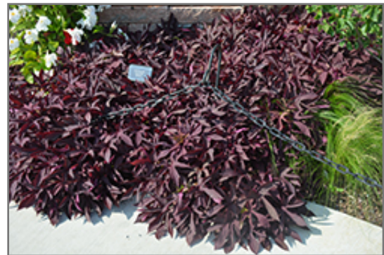
Sweet Caroline Red Hawk Sweet Potato Vine