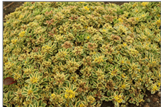
Rock 'N Low Boogie Woogie Stonecrop flowers

Rock 'N Low Boogie Woogie Stonecrop is a dense herbaceous perennial with a mounded form. Its medium texture blends into the garden, but can always be balanced by a couple of finer or coarser plants for an effective composition.