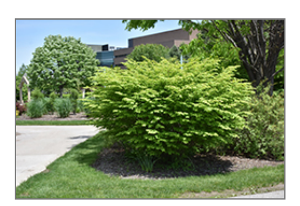
Unforgettable Fire Burning Bush