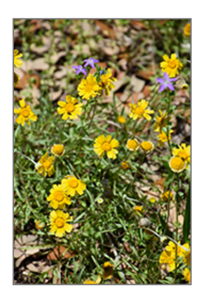
Four-nerve Daisy flowers