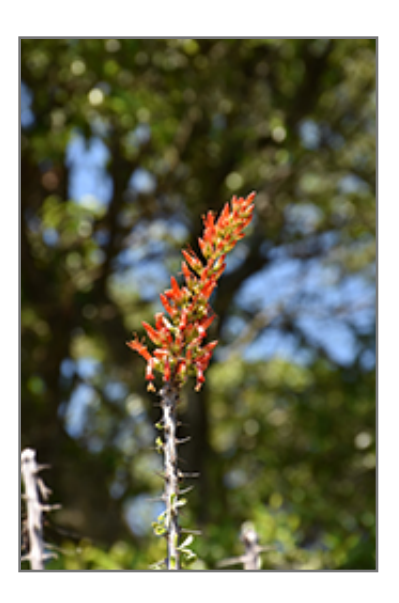
Mexican Tree Ocotillo flowers