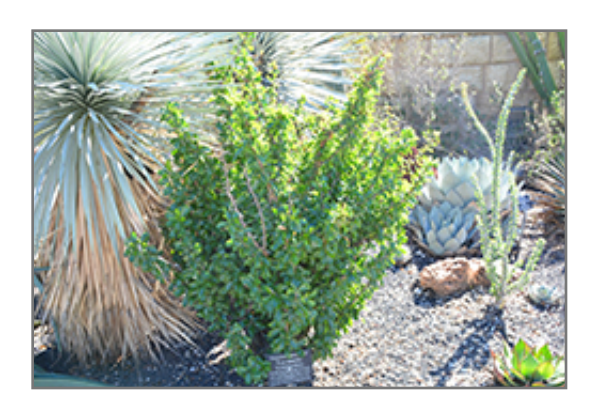
Mexican Tree Ocotillo

Mexican Tree Ocotillo is an open multi-stemmed deciduous shrub with an upright spreading habit of growth. Its average texture blends into the landscape, but can be balanced by one or two finer or coarser trees or shrubs for an effective composition.