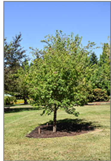
Great Wall Pekin Lilac