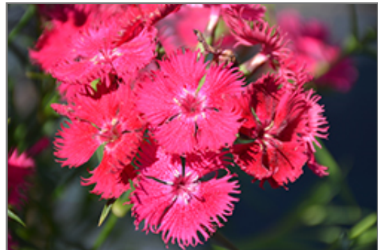
Rockin' Rose Pinks flowers

Rockin' Rose Pinks is recommended for the following landscape applications;