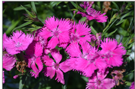
Rockin' Purple Pinks flowers

This is a relatively low maintenance plant, and is best cleaned up in early spring before it resumes active growth for the season. It is a good choice for attracting bees and butterflies to your yard, but is not particularly attractive to deer who tend to leave it alone in favor of tastier treats. It has no significant negative characteristics.