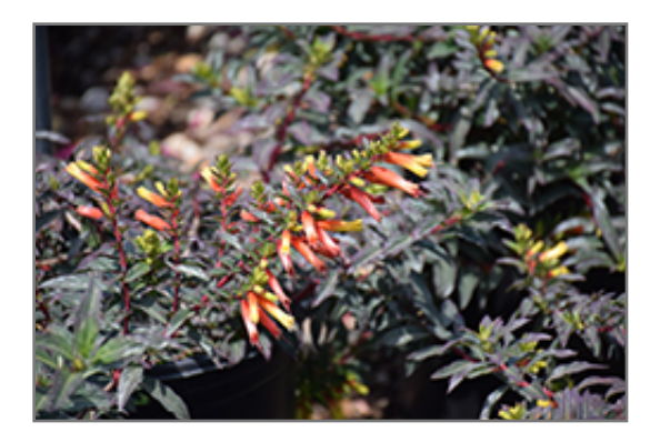
Candy Corn Plant flowers

Candy Corn Plant is an open multi-stemmed annual with an upright spreading habit of growth. Its relatively fine texture sets it apart from other garden plants with less refined foliage.