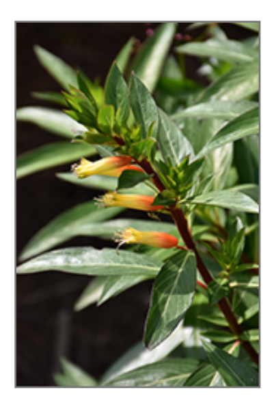
Candy Corn Plant flowers

This is a relatively low maintenance plant, and is best cleaned up in early spring before it resumes active growth for the season. It is a good choice for attracting bees and butterflies to your yard. It has no significant negative characteristics.