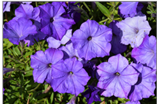
Easy Wave Lavender Sky Blue Petunia flowers

This plant will require occasional maintenance and upkeep. Trim off the flower heads after they fade and die to encourage more blooms late into the season. It is a good choice for attracting bees and hummingbirds to your yard, but is not particularly attractive to deer who tend to leave it alone in favor of tastier treats. It has no significant negative characteristics.