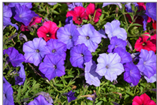
Easy Wave Lavender Sky Blue Petunia flowers