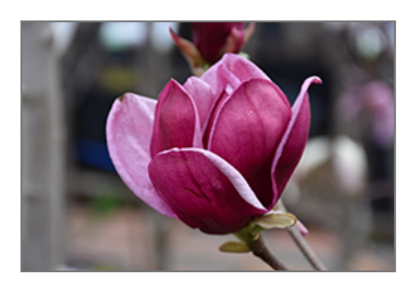
Genie Magnolia flowers