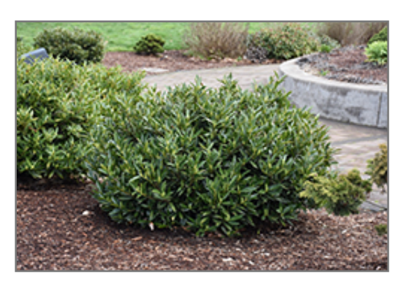
Jade Enchantress Cherry Laurel

Jade Enchantress Cherry Laurel is recommended for the following landscape applications;