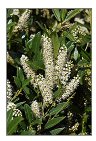
Jade Enchantress Cherry Laurel flowers