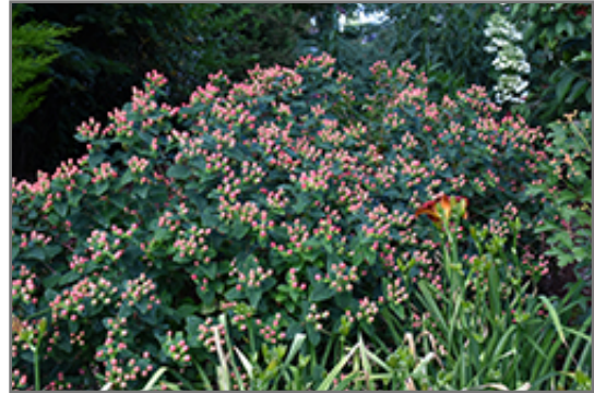
FloralBerry Rosé St. John's Wort fruit

FloralBerry Rosé St. John's Wort will grow to be about 3 feet tall at maturity, with a spread of 3 feet. It tends to fill out right to the ground and therefore doesn't necessarily require facer plants in front. It grows at a medium rate, and under ideal conditions can be expected to live for approximately 5 years. This is a self-pollinating variety, so it doesn't require a second plant nearby to set fruit.