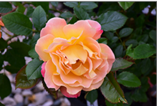
Rosie The Riveter Rose flowers

This shrub will require occasional maintenance and upkeep, and is best pruned in late winter once the threat of extreme cold has passed. It is a good choice for attracting bees to your yard. Gardeners should be aware of the following characteristic(s) that may warrant special consideration;