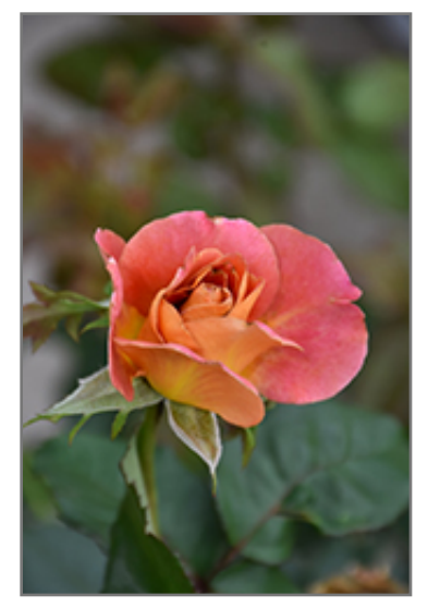
Rosie The Riveter Rose flower buds