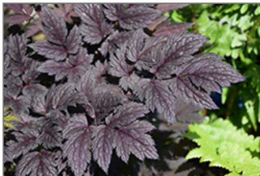
Pink Spike Bugbane foliage