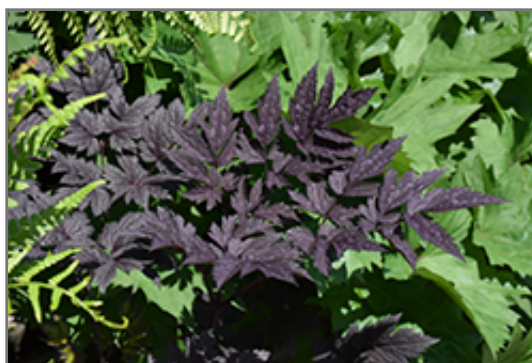
Pink Spike Bugbane foliage