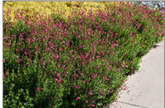
Pink Autumn Sage in bloom