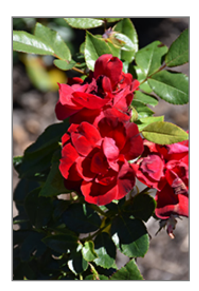
Brick House Rose flowers