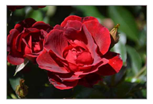
Brick House Rose flowers

Brick House Rose is recommended for the following landscape applications;