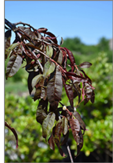
Crimson Cascade Weeping Peach foliage

This tree should only be grown in full sunlight. It does best in average to evenly moist conditions, but will not tolerate standing water. It may require supplemental watering during periods of drought or extended heat. It is not particular as to soil type or pH. It is highly tolerant of urban pollution and will even thrive in inner city environments, and will benefit from being planted in a relatively sheltered location. This is a selected variety of a species not originally from North America.