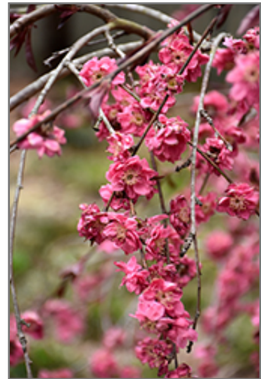
Crimson Cascade Weeping Peach flowers

Crimson Cascade Weeping Peach is recommended for the following landscape applications;