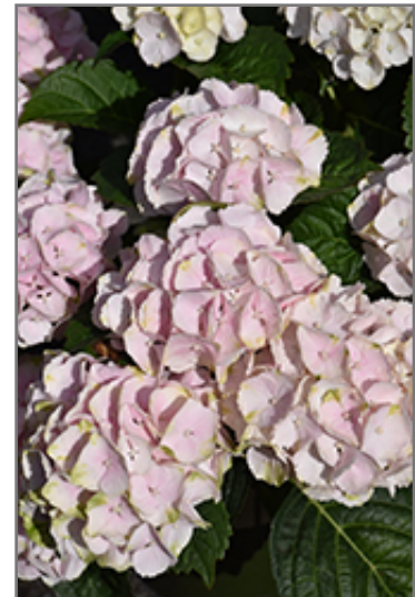
Seaside Serenade Cape Lookout Hydrangea flowers

This shrub will require occasional maintenance and upkeep, and should only be pruned after flowering to avoid removing any of the current season's flowers. It has no significant negative characteristics.