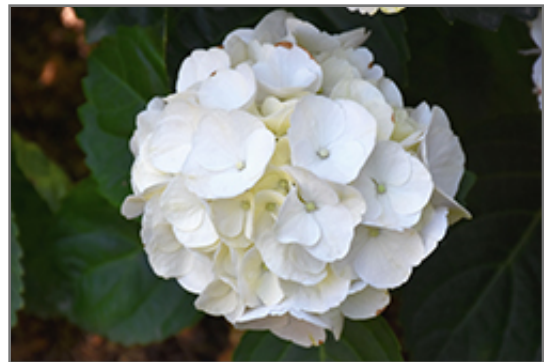
Seaside Serenade Cape Lookout Hydrangea flowers