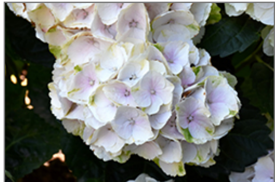
Seaside Serenade Cape Lookout Hydrangea flowers

Seaside Serenade Cape Lookout Hydrangea makes a fine choice for the outdoor landscape, but it is also well-suited for use in outdoor pots and containers. Because of its height, it is often used as a 'thriller' in the 'spiller-thriller-filler' container combination; plant it near the center of the pot, surrounded by smaller plants and those that spill over the edges. It is even sizeable enough that it can be grown alone in a suitable container. Note that when grown in a container, it may not perform exactly as indicated on the tag - this is to be expected. Also note that when growing plants in outdoor containers and baskets, they may require more frequent waterings than they would in the yard or garden.