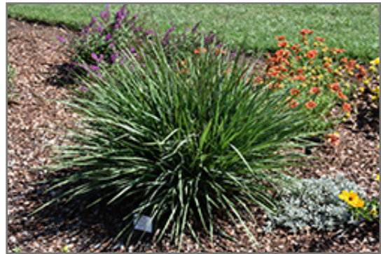
Coolvista Dianella

Coolvista Dianella will grow to be about 24 inches tall at maturity, with a spread of 24 inches. Its foliage tends to remain dense right to the ground, not requiring facer plants in front. It grows at a medium rate, and under ideal conditions can be expected to live for approximately 10 years. As an evergreen perennial, this plant will typically keep its form and foliage year-round.