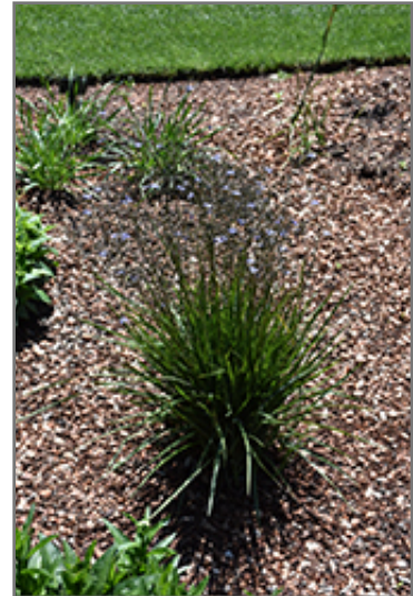
Coolvista Dianella in bloom