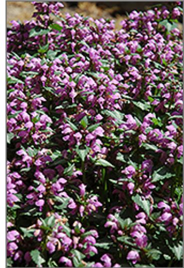
Beacon Silver Spotted Dead Nettle flowers

Beacon Silver Spotted Dead Nettle is a fine choice for the garden, but it is also a good selection for planting in outdoor pots and containers. Because of its spreading habit of growth, it is ideally suited for use as a 'spiller' in the 'spiller-thriller-filler' container combination; plant it near the edges where it can spill gracefully over the pot. Note that when growing plants in outdoor containers and baskets, they may require more frequent waterings than they would in the yard or garden.