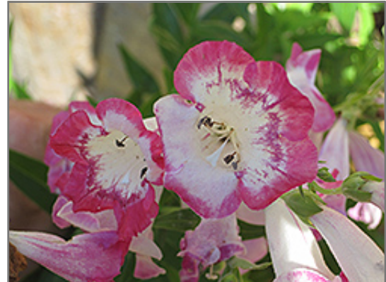
Bev Jensen Beard Tongue flowers