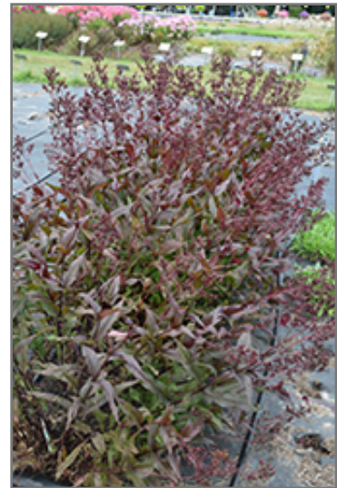
Pocahontas Beard Tongue

Pocahontas Beard Tongue is recommended for the following landscape applications;