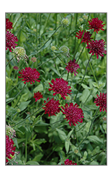
Crimson Scabious flowers

This plant does best in full sun to partial shade. It prefers to grow in average to dry locations, and dislikes excessive moisture. It is considered to be drought-tolerant, and thus makes an ideal choice for a low-water garden or xeriscape application. It is not particular as to soil type, but has a definite preference for alkaline soils. It is somewhat tolerant of urban pollution. This species is not originally from North America.