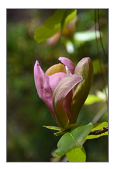
Woodsman Magnolia flowers