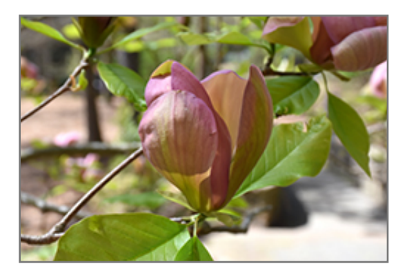
Woodsman Magnolia flowers