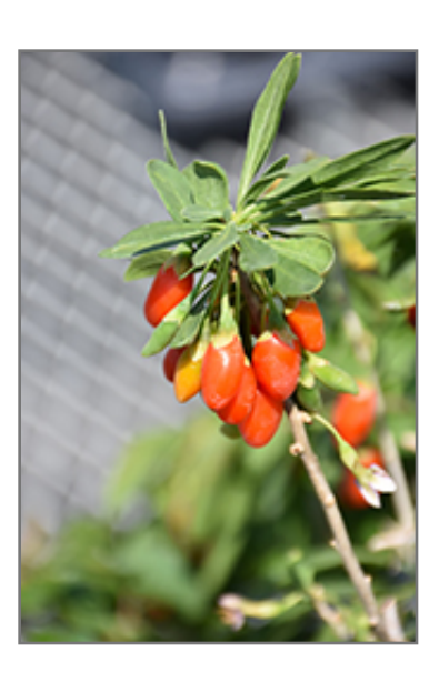
Firecracker Goji Berry flowers

Aside from its primary use as an edible, Firecracker Goji Berry is sutiable for the following landscape applications;