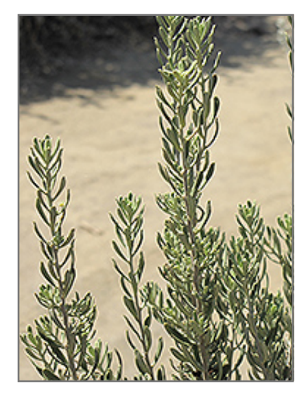
Houdini Sage foliage