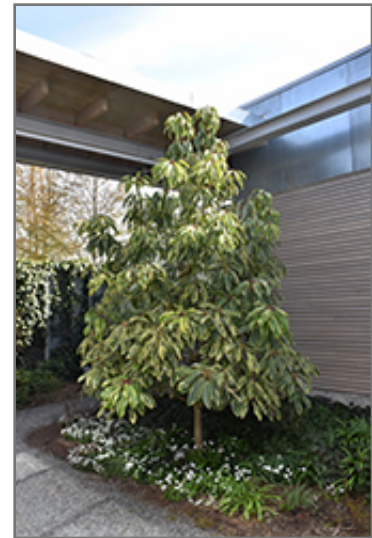
Mountain Dove Japanese Daphniphyllum

Mountain Dove Japanese Daphniphyllum makes a fine choice for the outdoor landscape, but it is also well-suited for use in outdoor pots and containers. Because of its height, it is often used as a 'thriller' in the 'spiller-thriller-filler' container combination; plant it near the center of the pot, surrounded by smaller plants and those that spill over the edges. It is even sizeable enough that it can be grown alone in a suitable container. Note that when grown in a container, it may not perform exactly as indicated on the tag - this is to be expected. Also note that when growing plants in outdoor containers and baskets, they may require more frequent waterings than they would in the yard or garden.