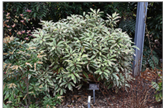
Mountain Dove Japanese Daphniphyllum