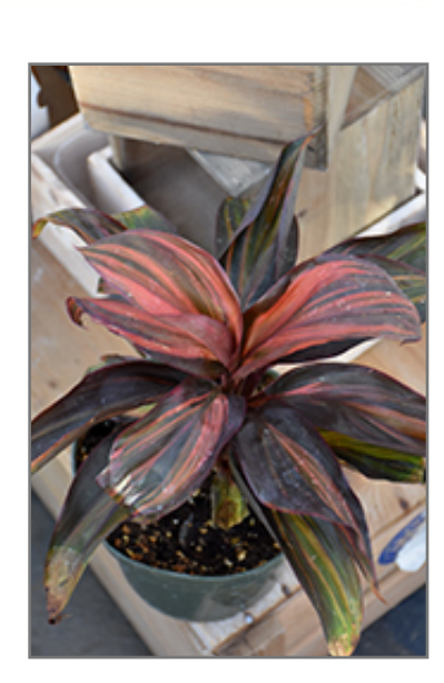
Cherry Cordial Hawaiian Ti Plant in full

Cherry Cordial Hawaiian Ti Plant is primarily valued in the home for its ornamental upright and spreading habit of growth. Its attractive crinkled oval leaves emerge dark red, turning burgundy in color with showy cherry red variegation and tinges of olive green throughout the year.