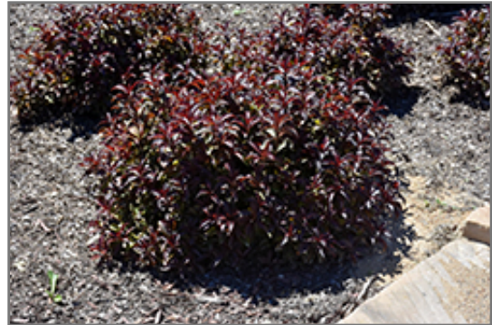
Colorstar Merlot Pink Weigela