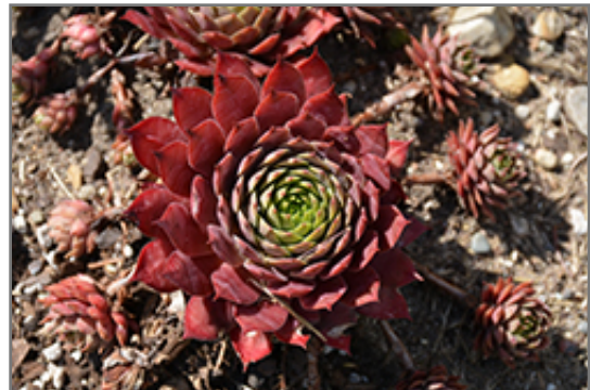
Peggy Hens And Chicks

This is a dense herbaceous houseplant with tall flower stalks held atop a low mound of foliage. Its relatively fine texture sets it apart from other indoor plants with less refined foliage. This plant should not require much pruning, except when necessary to keep it looking its best.