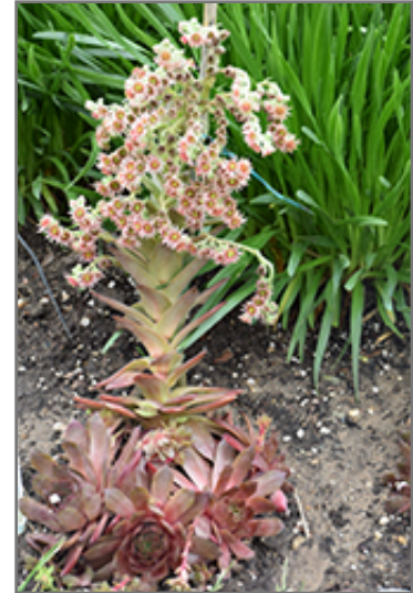
Peggy Hens And Chicks in bloom

When grown indoors, Peggy Hens And Chicks can be expected to grow to be only 5 inches tall at maturity extending to 12 inches tall with the flowers, with a spread of 8 inches. It grows at a medium rate, and under ideal conditions can be expected to live for approximately 20 years. This houseplant requires direct sun for optimal performance, and should therefore be situated in a room that gets bright sunlight for a good part of the day; it is not a good choice for rooms lit only by artificial light. It prefers dry to average moisture levels with very well-drained soil, and may die if left in standing water for any length of time. This plant should be watered when the surface of the soil gets dry, and will need watering approximately once each week. Be aware that your particular watering schedule may vary depending on its location in the room, the pot size, plant size and other conditions; if in doubt, ask one of our experts in the store for advice. It is not particular as to soil pH, but grows best in sandy soil. Contact the store for specific recommendations on pre-mixed potting soil for this plant.