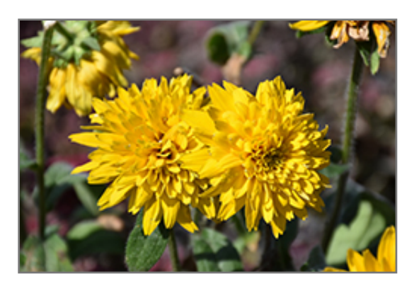
Gloriosa Double Daisy Coneflower flowers