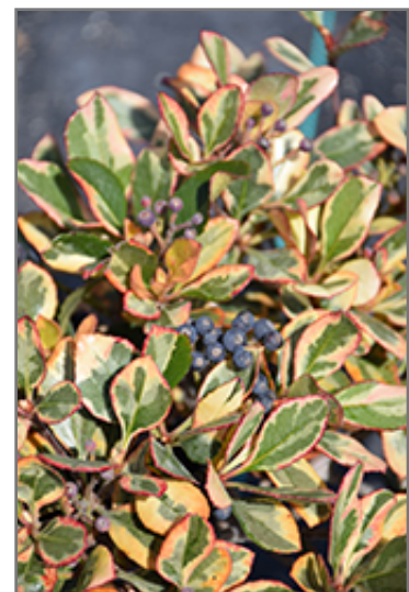
Fiesta Variegated Indian Hawthorn foliage