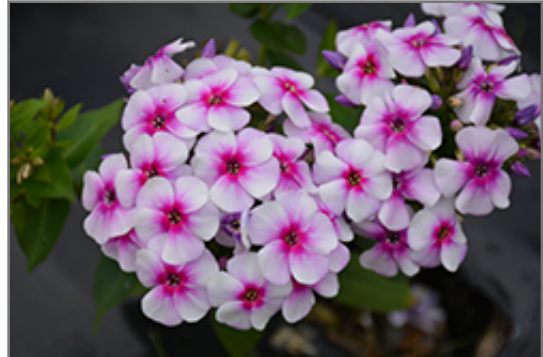
Ka-Pow White Bicolor Garden Phlox flowers

Ka-Pow White Bicolor Garden Phlox is recommended for the following landscape applications;