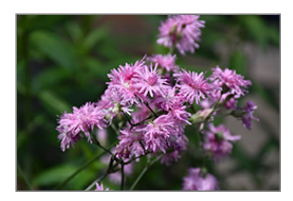
Petite Jenny Ragged Robin Campion flowers

Petite Jenny Ragged Robin Campion is recommended for the following landscape applications;