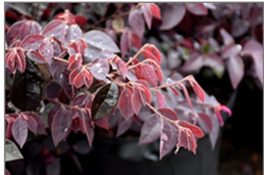
Dark Fire Fringeflower foliage

Dark Fire Fringeflower is recommended for the following landscape applications;